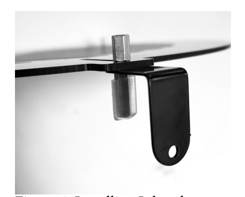
Figure 4. Installing L-bracket

#608022 was designed to fit 12" ACF and Schmidt-Cassegrain telescopes, but it also includes 3 L-brackets which may be used to fit different telescopes for a slightly wider range of apertures. Unthread the Locking Nuts from the Attachment Pegs, then place the L-bracket mounting hole between the Attachment Pegs and Bahtinov Mask and reattach the Locking Nuts (Figure 4). Adjust the distancing as needed so that the L-brackets fit on the outside diameter of the telescope (Figure 5).