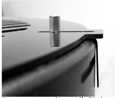
Figure 5. Properly installed L-bracket