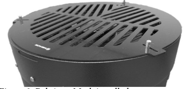
Figure 2. Bahtinov Mask installed